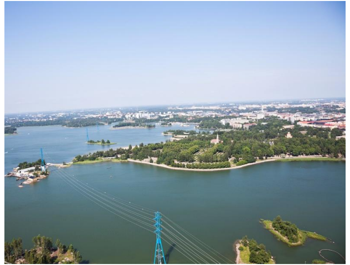
Helsinki metropolitan area

Metropolia UAS is Finland's largest university of applied sciences. Metropolia UAS has several campuses in Helsinki metropolitan area but all Summer School courses are held in Leppävaara campus in the city of Espoo. The city centre of Helsinki, the capital of Finland, is only 10 kilometres away. The public transport system in the metropolitan area is very practical. For example from Leppävaara station it takes only 12 - 17 minutes to Helsinki central railway station by commuter train.